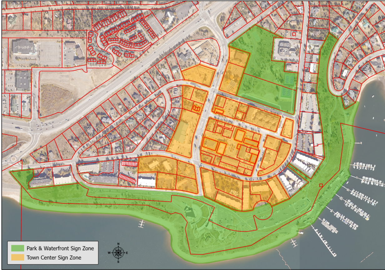
Figure 2. Potential Town Center Sign Zone and Park & Waterfront Sign Zone

Other Park & Waterfront Sign Zone areas to consider would be the Recreation Path Segments, Dillon Cemetery, Dillon Disc Golf Course, and the Dillon Nature Preserve.