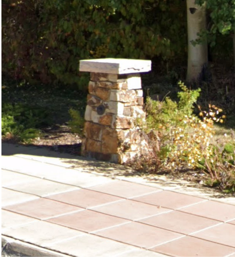
Figure 3. Stone Light Bollards on Lake Dillon Drive

Staff requests studying what regulations and design elements might best suit these proposed Sign Zones. Concepts for the Town Center Sign Zone might include blade signs that project perpendicular from a building out above the public realm, awning signs, integrated signage with store front architecture, new considerations for sandwich-board signs (A-signs), doorway signs or artwork, and perhaps murals and other artwork. Public information signs should have a consistent appearance and architectural character, Town branding, and provide clear messaging. The Town might consider bilingual informational signage, or QR Code sourced such information, as well.