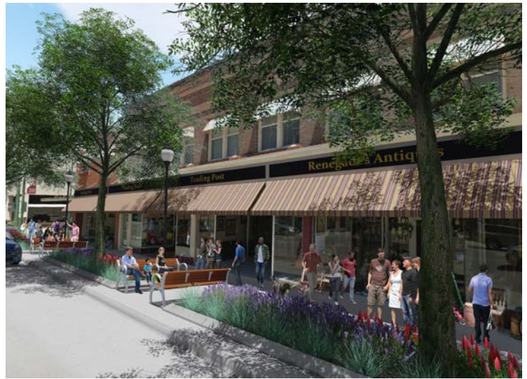
PROPOSED LINCOLN AVENUE