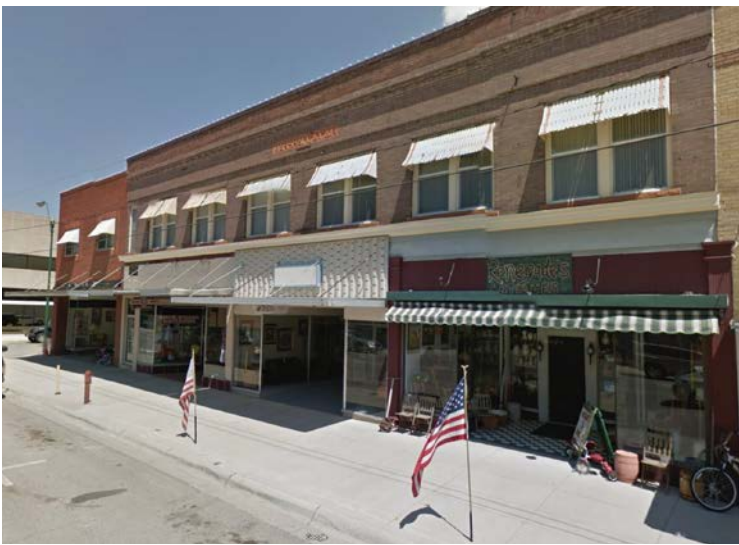
ORIGINAL LINCOLN AVENUE