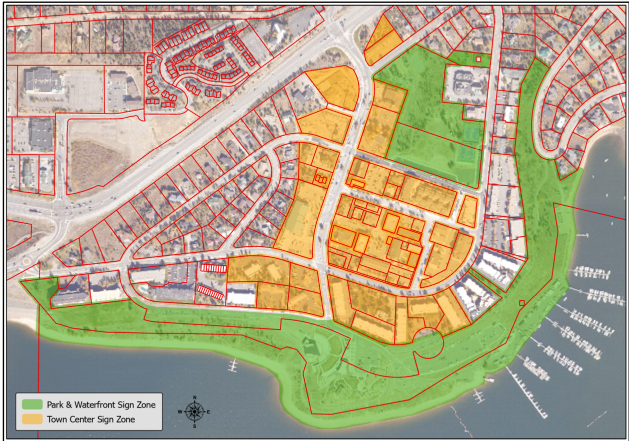
Figure 2. Proposed Town Center and Parks & Waterfront Sign Zones

The proposed new sign zones are shown in Figure 2 . In addition to the areas shown on this map. Additional areas are anticipated to be within the Parks and Waterfront Sign Zone: the Dillon Nature Preserve, the waterfront areas from the southern end of Tenderfoot Street along the lake to the Dillon Nature Preserve, and the Dillon Cemetery and surrounding areas.