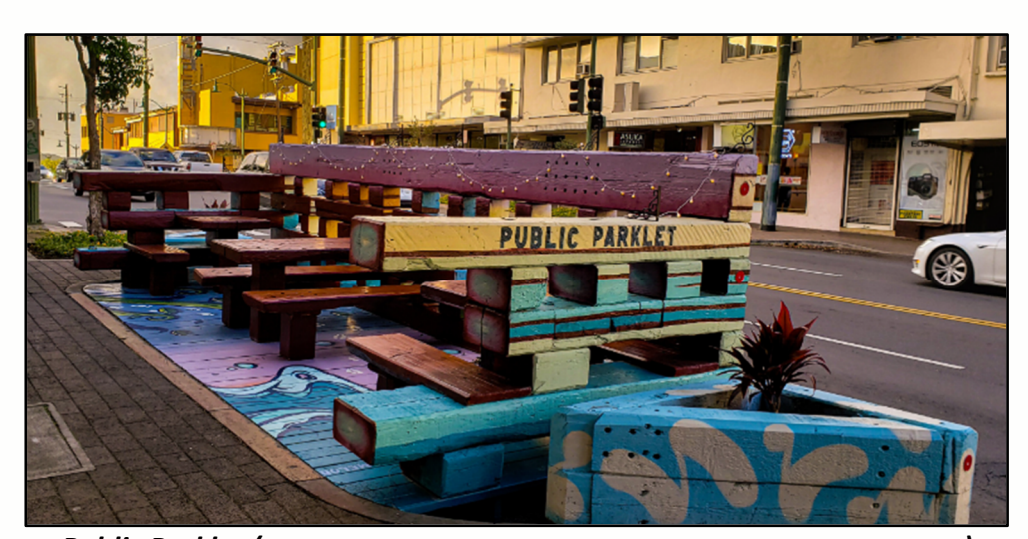
Public Parklet (https://www.honolulu.gov/tod/projects/dev-resources/parklets-program.html)

Town staff is interested in discussing Parklets with the Planning Commission as a potential feature to improve vibrancy and to increase potential public space.