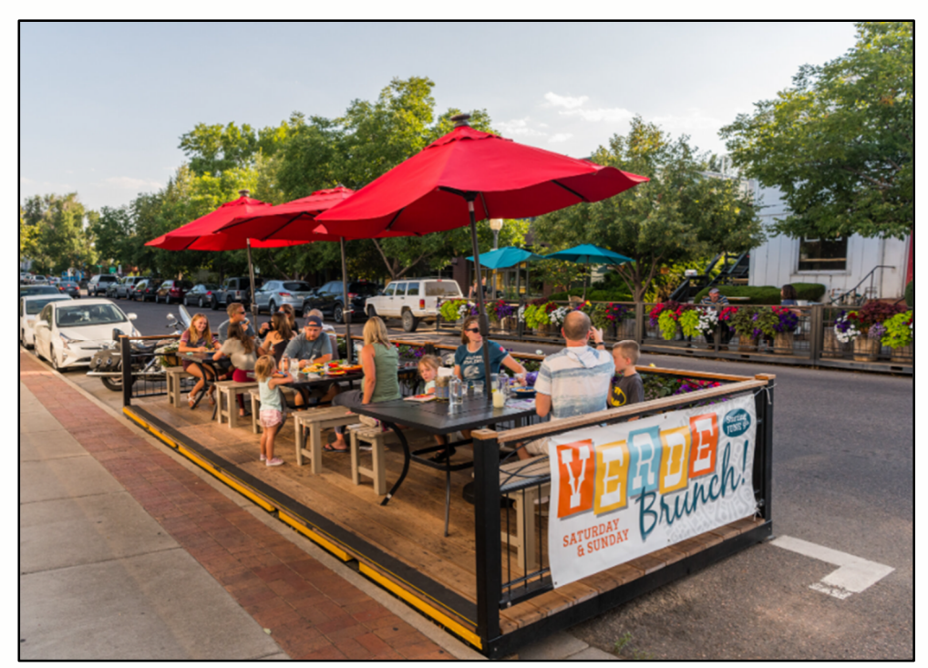
City of Louisville Colorado Parklet (Design Concepts https://www.dcla.net/louisville-parklets)