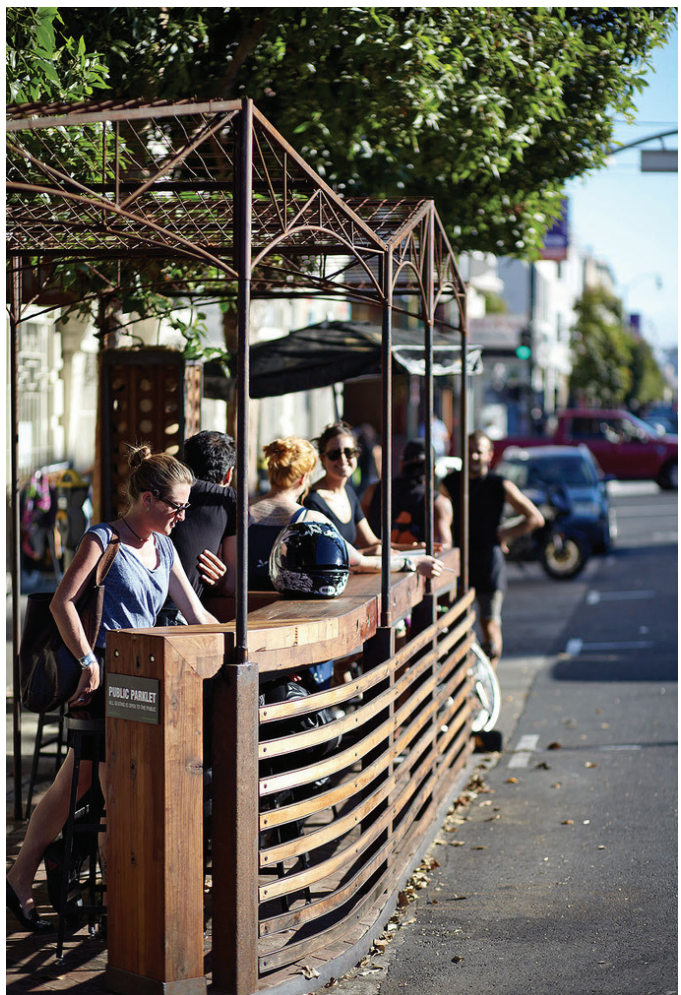
Figure 2 (Left top). Landscape-focused parklet. Courtesy San Francisco Planning Department; Figure 3 (right). Safety railing doubling as stand-up bar, San Francisco. Courtesy Bruce Damonte Photography; Figure 4 (Left bottom). Simplified parklet design in Minneapolis for storage during winter months. Courtesy Madeline Brozen.

ed into the roadway, and require a yearly permit renewal. The lifespan of these year-round installations has yet to be determined, as most projects have existed for less than three years as of this writing.