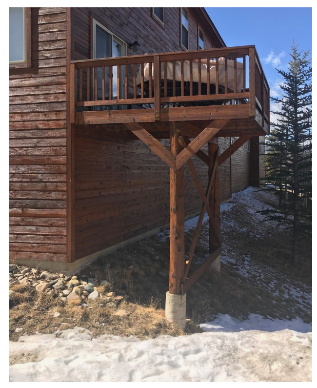
EXISTING DECK AT 30 CROWN CT. (PROPOSED DECK WILL MATCH)