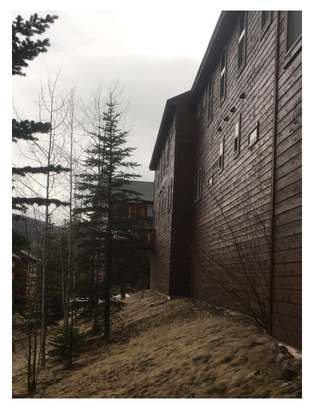
VIEW OF PROPOSED SITE WITH EXISTING