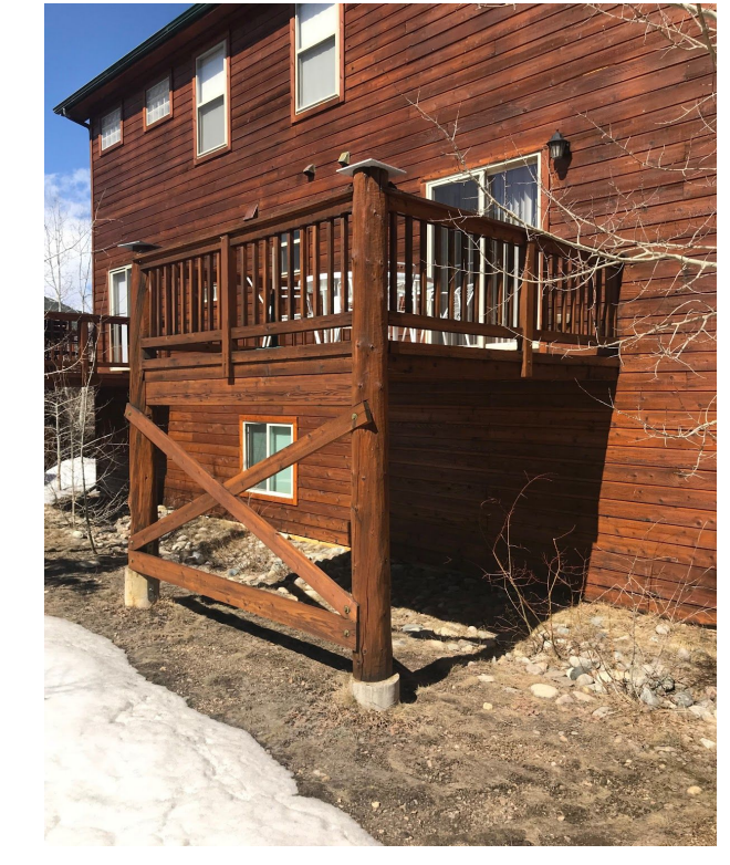
EXISTING DECK IN ANOTHER BUILDING SIMILAR CONSTRUCTION