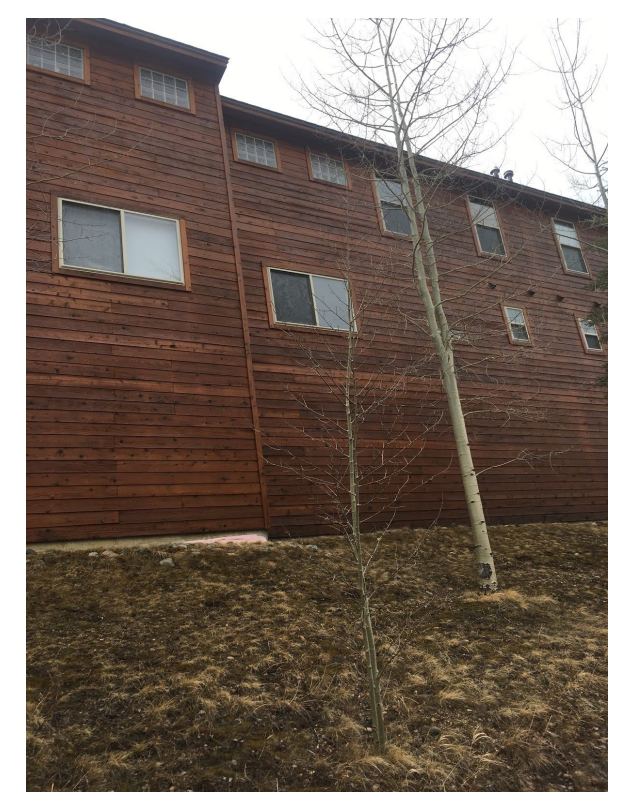
VIEW OF PROPOSED SITE