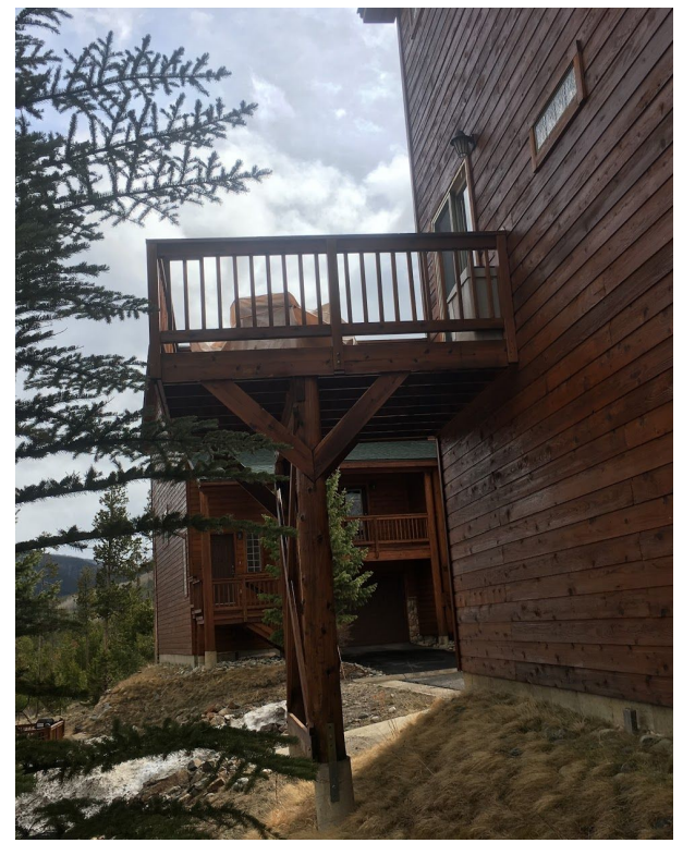
EXISTING DECK AT 30 CROWN CT (PROPOSED DECK WILL MATCH)