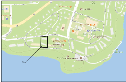
Vicinity Map 1" = 400'