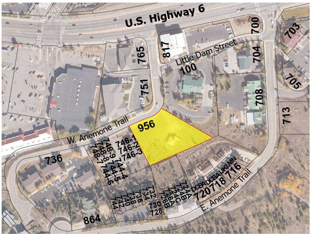
Figure 1. 956 W. Anemone Trail Building Vicinity

The dimensional criteria of the Code and the PUD Sign Plan are met with this application. See the sign application packet as Exhibit 'A' of the Resolution PZ 04-22, Series of 2022.