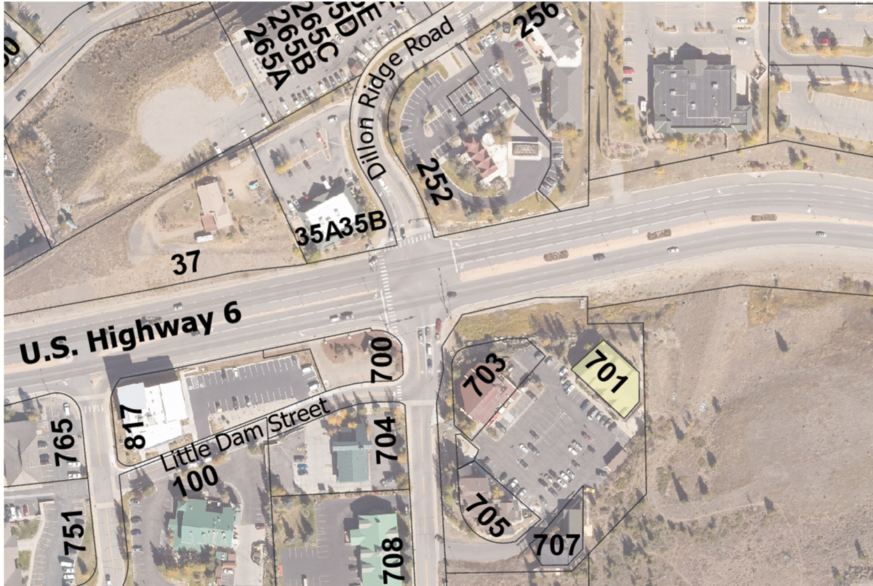
Figure 1. Vicinity of 701 E. Anemone Trail

Zoning District & Sign Zone: The Application is located in the Commercial (C) Zone district and is within Sign Zone B. The Application is also within the Red Mountain Plaza business complex that has a freestanding Business Area Directory Sign.