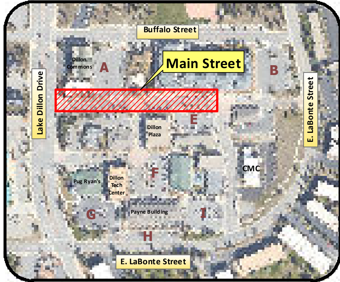
Dillon Town Center Location Map