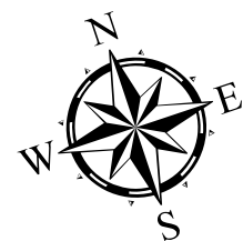
Dillon Town Center Location Map

Parking Study Notes: Parking Lot 'A' was shown to be moderately used. It typically only needs about 25-30 spaces. The New Parking Lot will provide 46 SPACES.