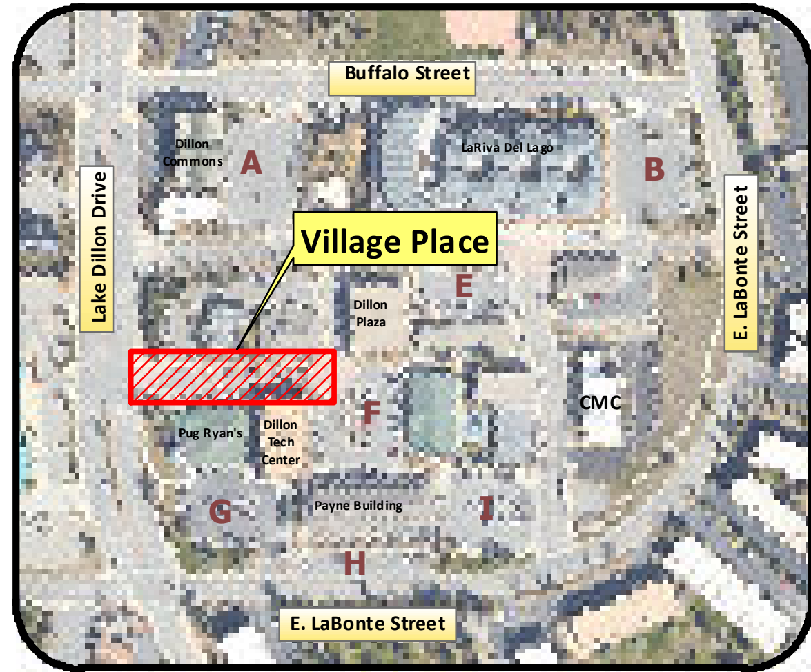
Dillon Town Center Location Map