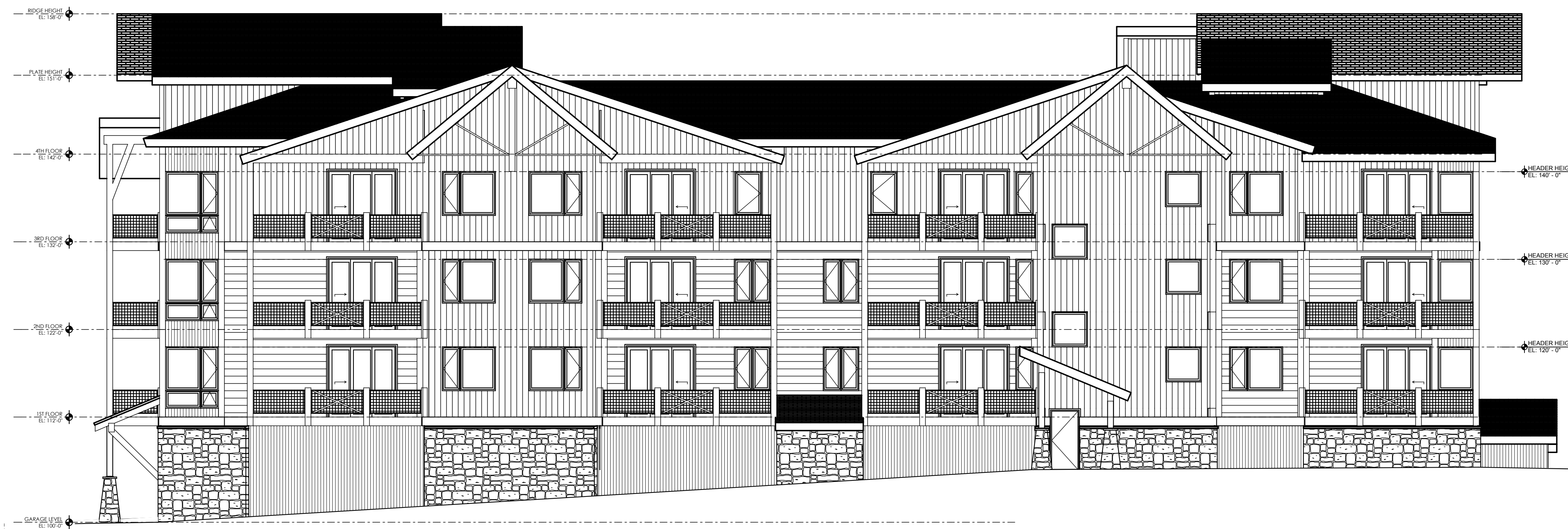
2 EAST ELEVATION A-8 SCALE: 1/8" = 1'-0"