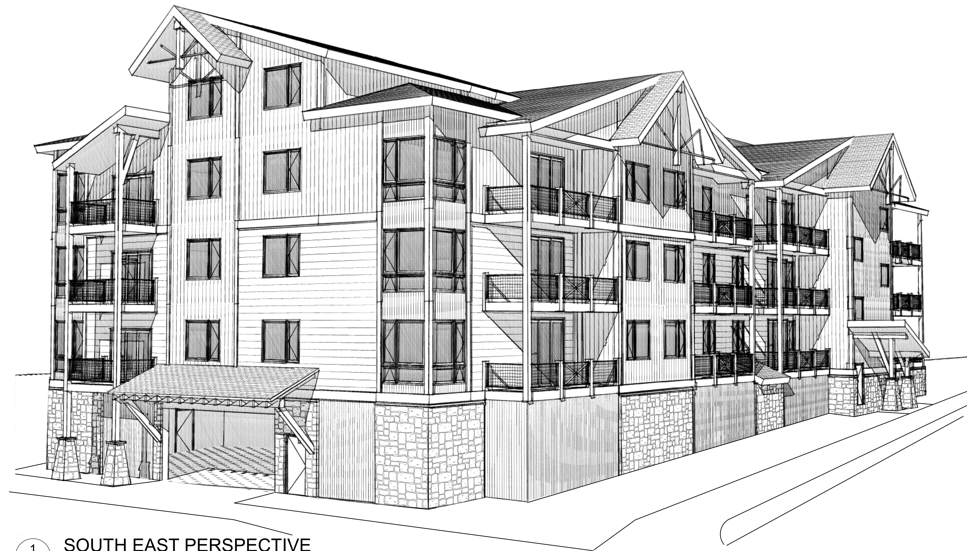
1 SOUTH EAST PERSPECTIVE A-0 NOT TO SCALE

© COPYRIGHT REUSE OR REPRODUCTION OF THIS DOCUMENT IS NOT PERMITTED WITHOUT WRITTEN PERMISSION OF ARAPAHOE ARCHITECTS, P.C.