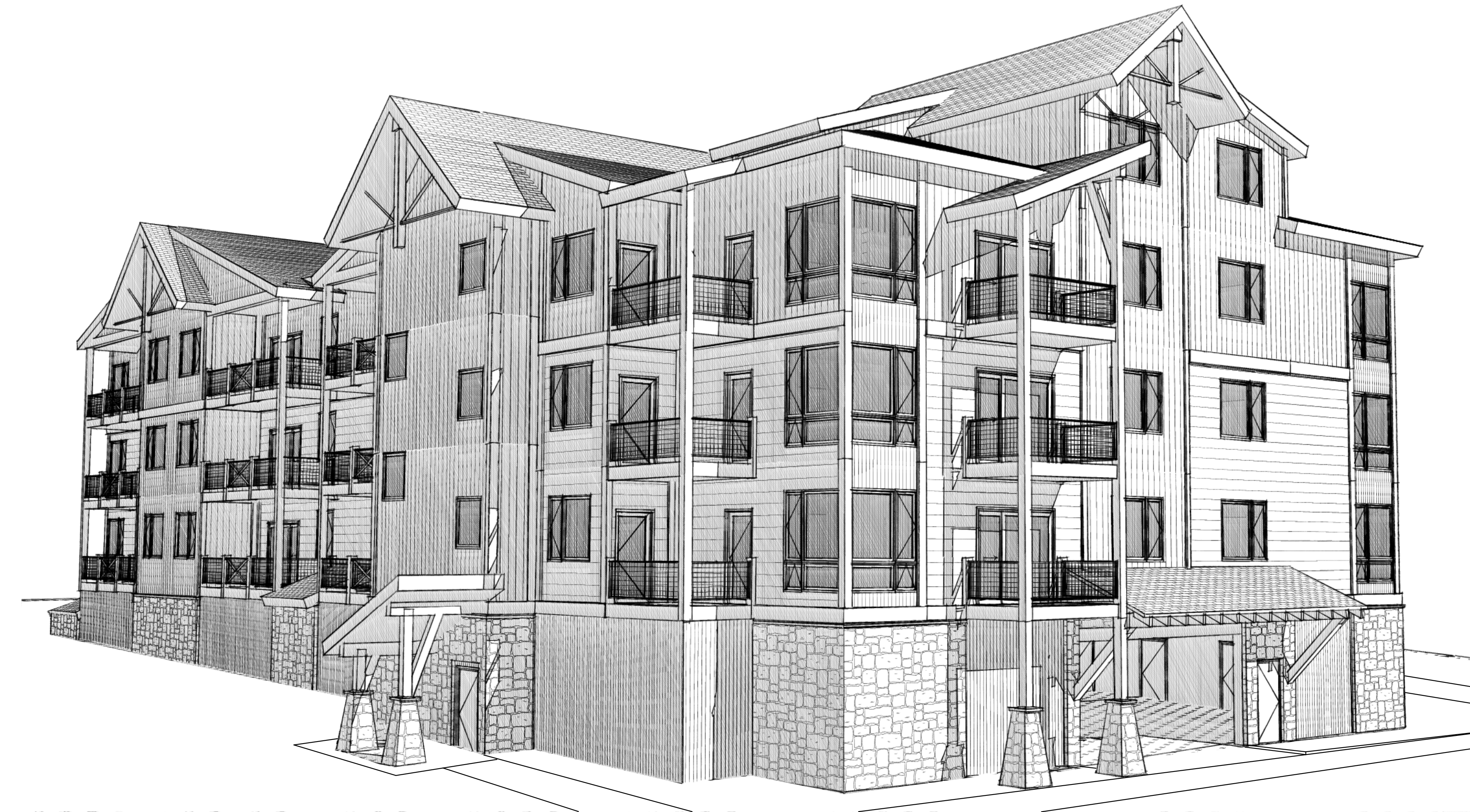
2 SOUTH WEST PERSPECTIVE A-0 NOT TO SCALE