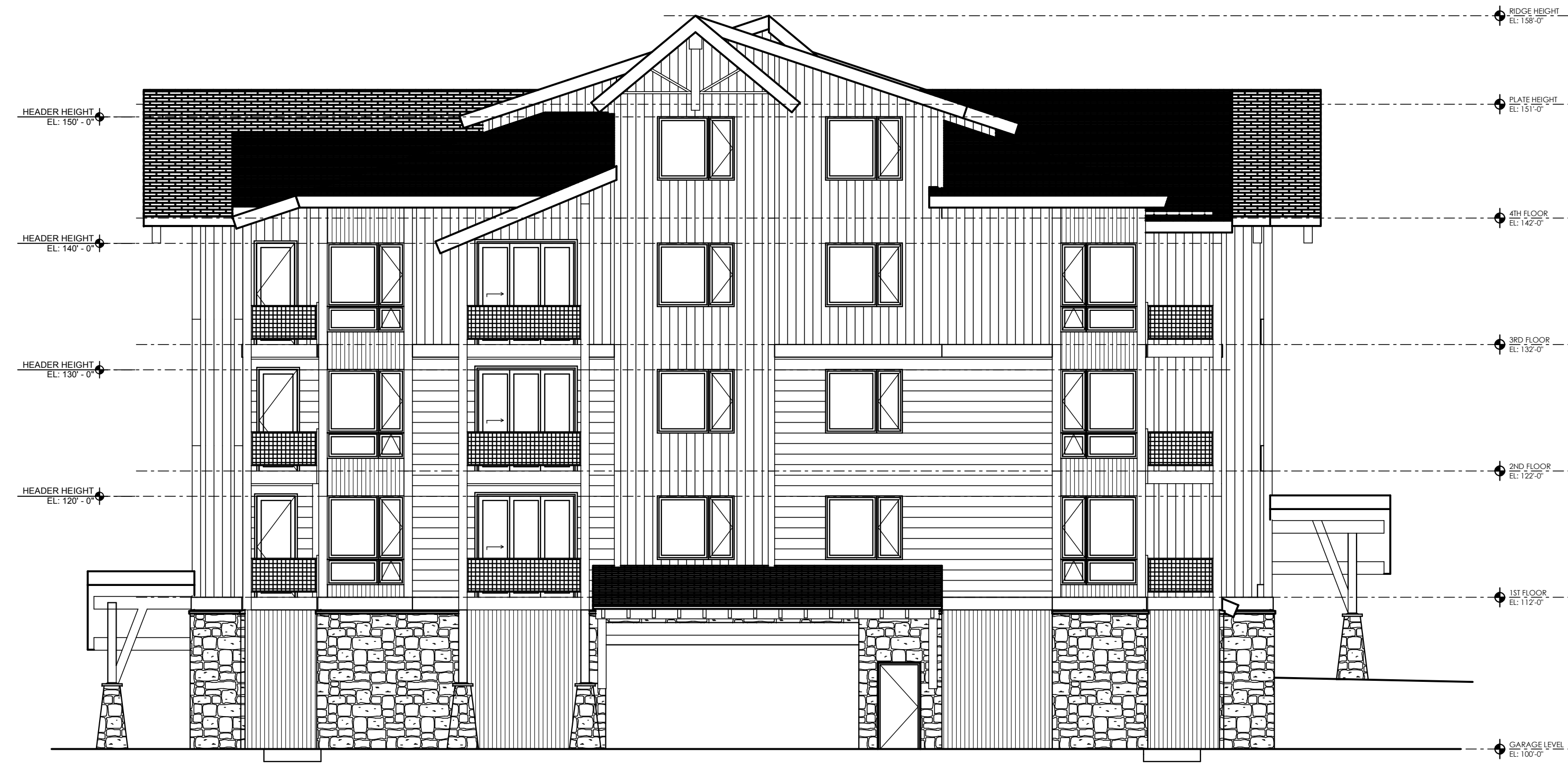
1 SOUTH ELEVATION A-8 SCALE: 1/8" = 1'-0"