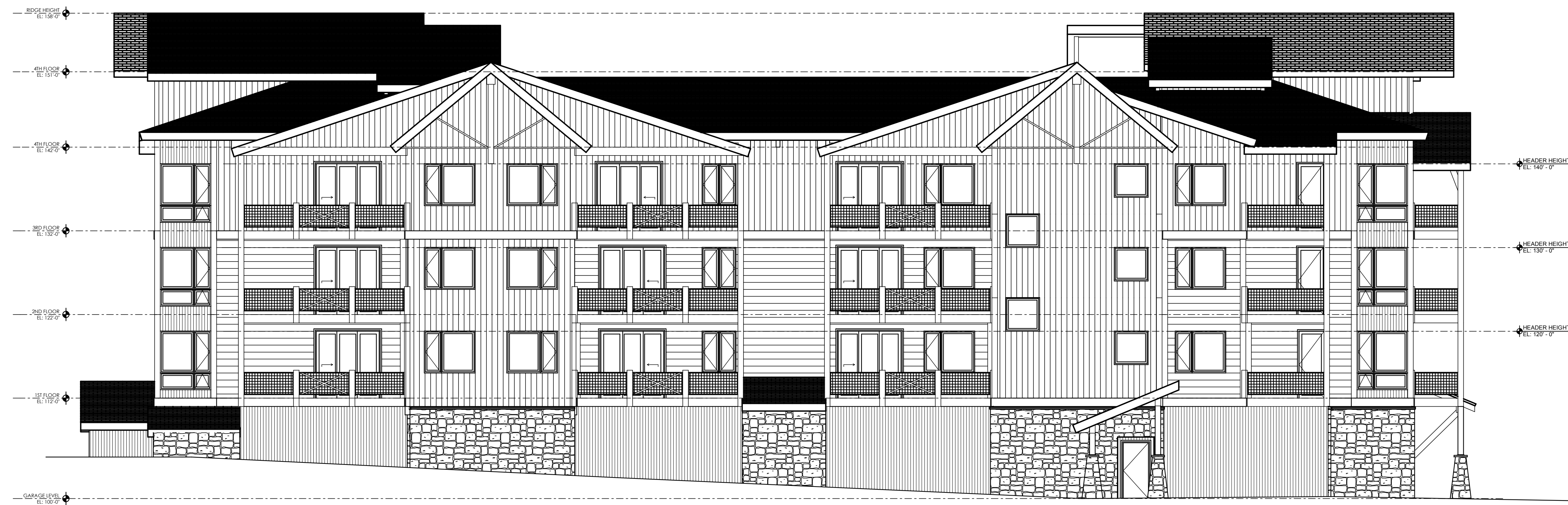
2 WEST ELEVATION SCALE: 1/8" = 1'-0"