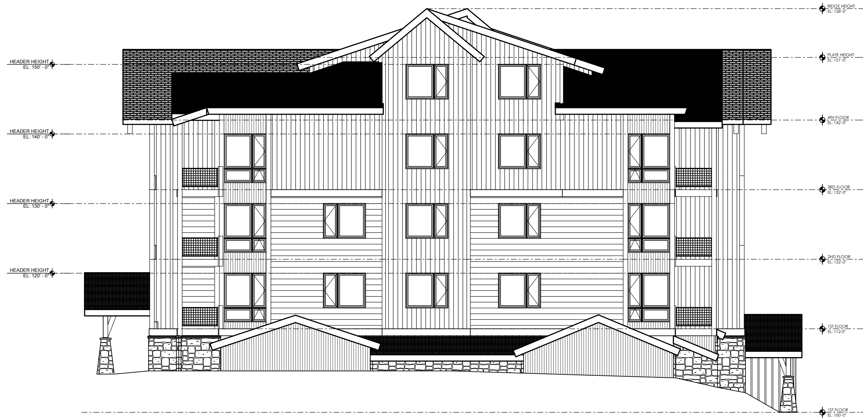
1 NORTH ELEVATION SCALE: 1/8" = 1'-0"