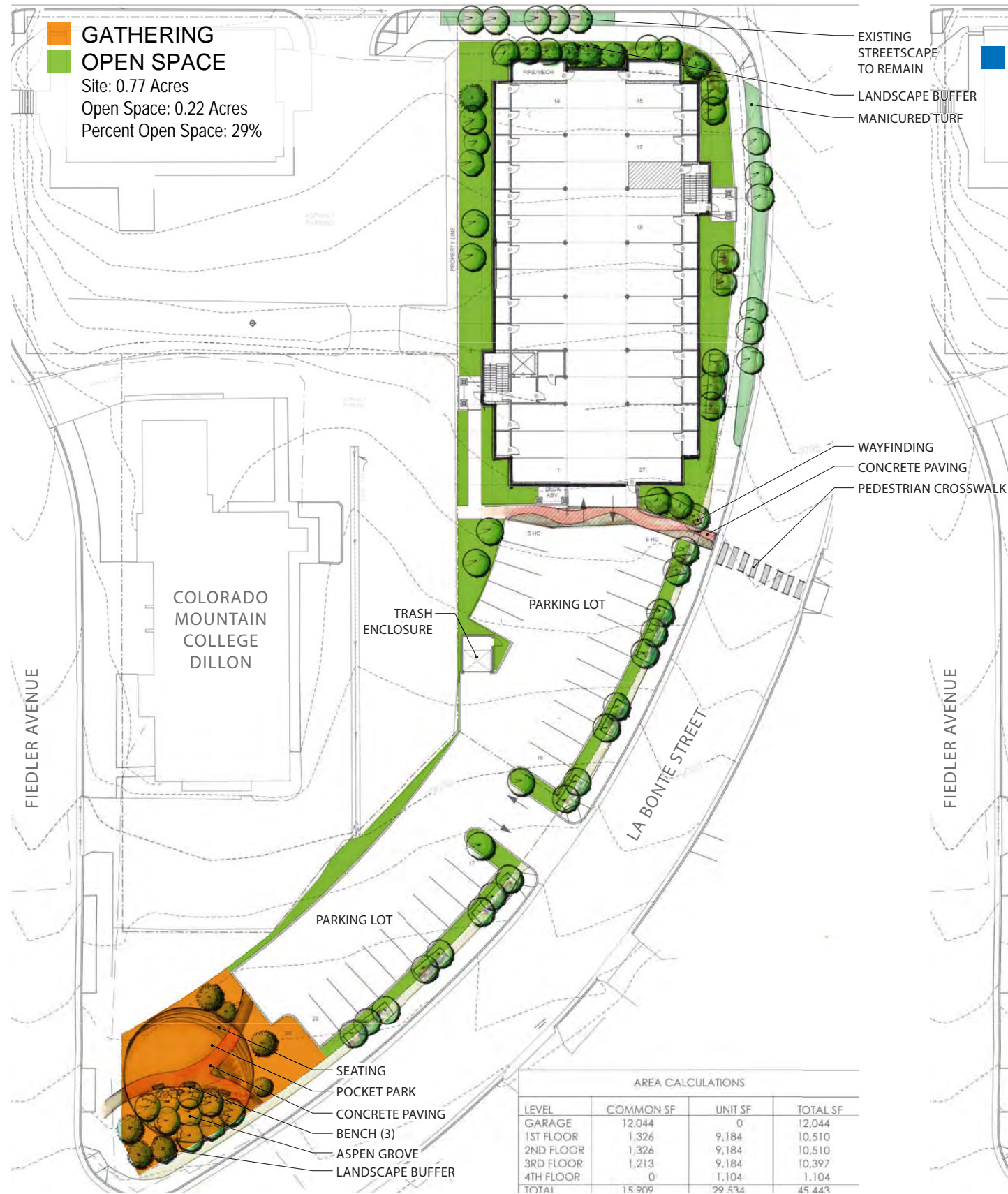
OPEN & GATHERING SPACE EXHIBIT A 07.14.17